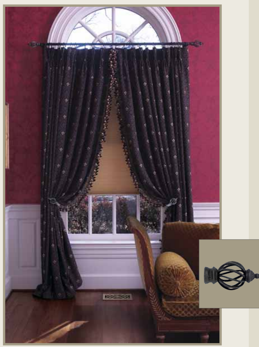
Featured here: Kirsch® Wrought Iron Bird Cage Finials in Black finish with coordinating holdbacks