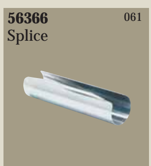
56366 Splice Size: 6" long